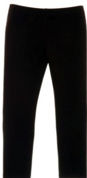
BLACK JOGGER /BLACK LEGGINGS