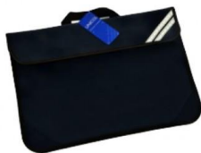
BOOKBAG (available to order or buy from school)