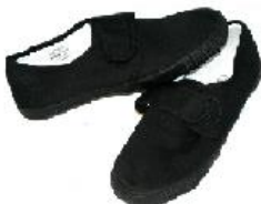
BLACK PLIMSOLLS OR TRAINERS