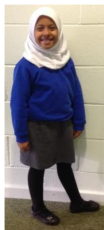
PLAIN SHORT BLACK/ WHITE HIJAB