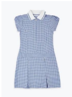
BLUE CHECKED DRESS