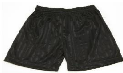
WHITE TSHIRT BLACK/NAVY SHORTS