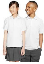
WHITE POLO SHIRT