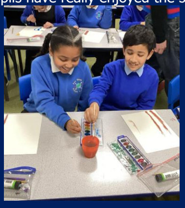
The art session in Bluebells