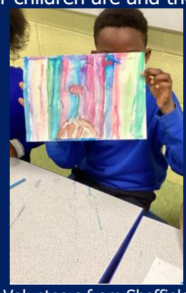
Volunteers from Sheffield University ran an art project in Bluebells