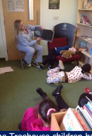
The Treehouse children had a story in the library!