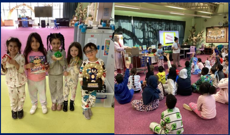
Y1 with their decorated potatoes!

We had lots of fun yesterday on World Book Day! Here are some of the things we got up to!