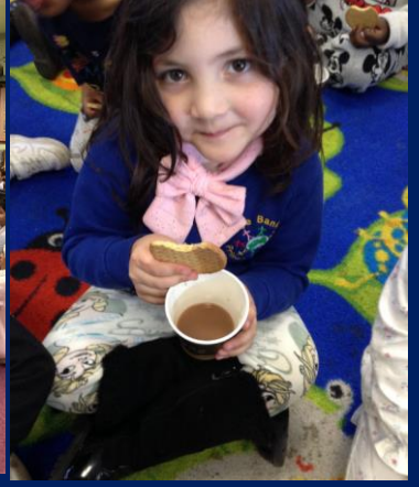
We all had a 'bedtime story' with hot chocolate!