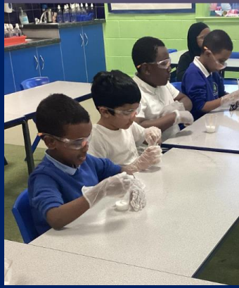
Making slime from scratch in the Amzelabs after school club