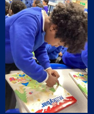
Chocolate advent calendar treats!