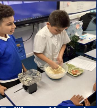
Frailling cookies for the winter fair!