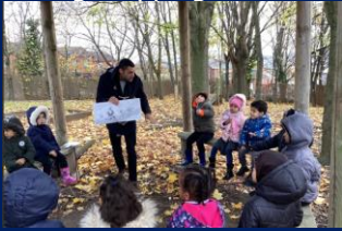
Exploring the school grounds