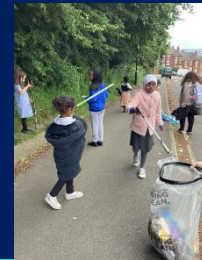
Keeping our local area litter-free!