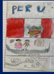
Writing a travel brochure about Peru in Y4