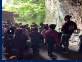
Y3 fieldwork trip to Castleton