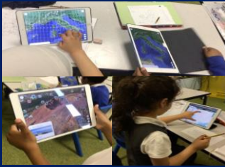
Using mapping software

As outlined at the top this newsletter, we have achieved the Silver Geography Quality Mark! Here are some photos of the fantastic Geography that takes place at Pye Bank!