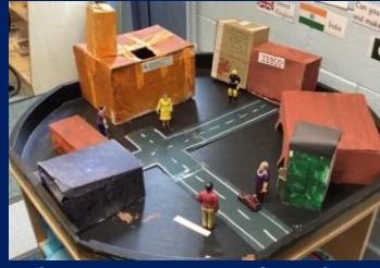
Making 3D maps in foundation