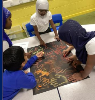
Year 3 are learning about the Stone Age and made cave paintings.