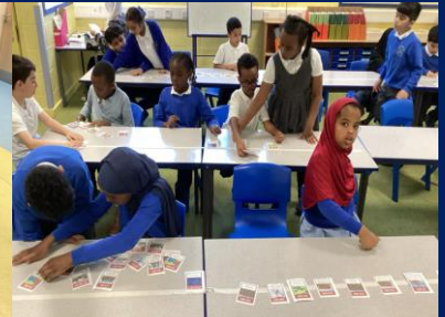
Year 4 made giant timelines of the Roman Empire by ordering pictures of events on their tables