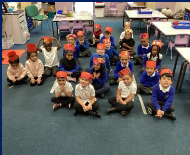
Year 1 are learning about the monarchy and made crowns to be a king or a queen!

At Pye Bank, we love learning History! In fact, we love it so much that we are one of the only schools in Sheffield to have been awarded the Gold History Quality Mark by the Historical Association. In their time at Pye Bank, children learn about Britain from the Stone Age to the present day, and about ancient civilisations such as the Romans and Egyptians. Here are some photos of some history lessons that have taken place in the last couple of weeks.